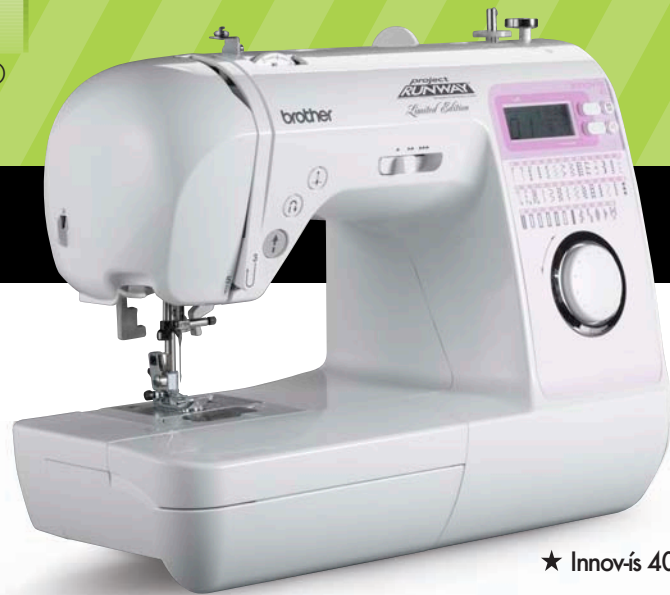
★ Innov-ís 40

Whether you're new to fashion sewing or a skilled veteran of the fitting room, you'll love the creative potential the Innov-ís 40 brings to your design table. Dream it, then do it with the Innov-ís 40's wide array of decorative stitches and convenient machine features. Made by Brother, powered by your imagination!